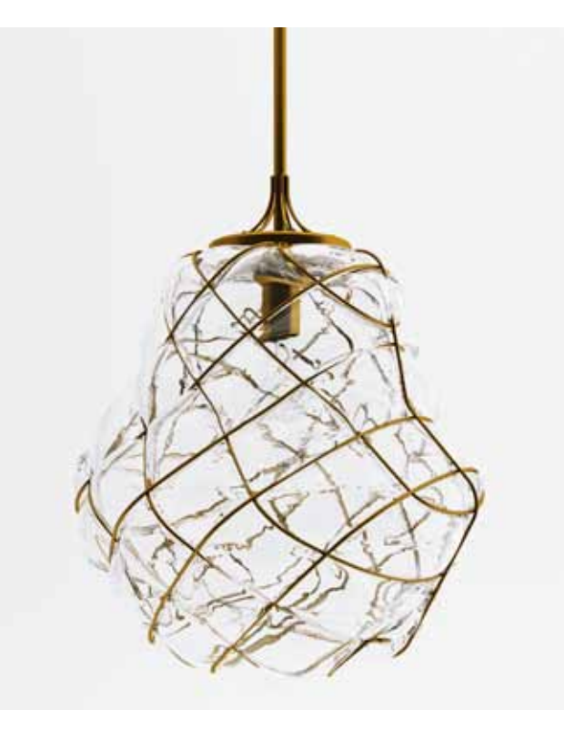
REMINISCENT OF AN ANTIQUE OIL LANTERN, THE PENDANT LAMP, BY STEPHEN BURKS FOR MATTERMADE, SPORTS A CONTEMPORARY SHELL OF BLOWN GLASS AND BRASS WIRE.