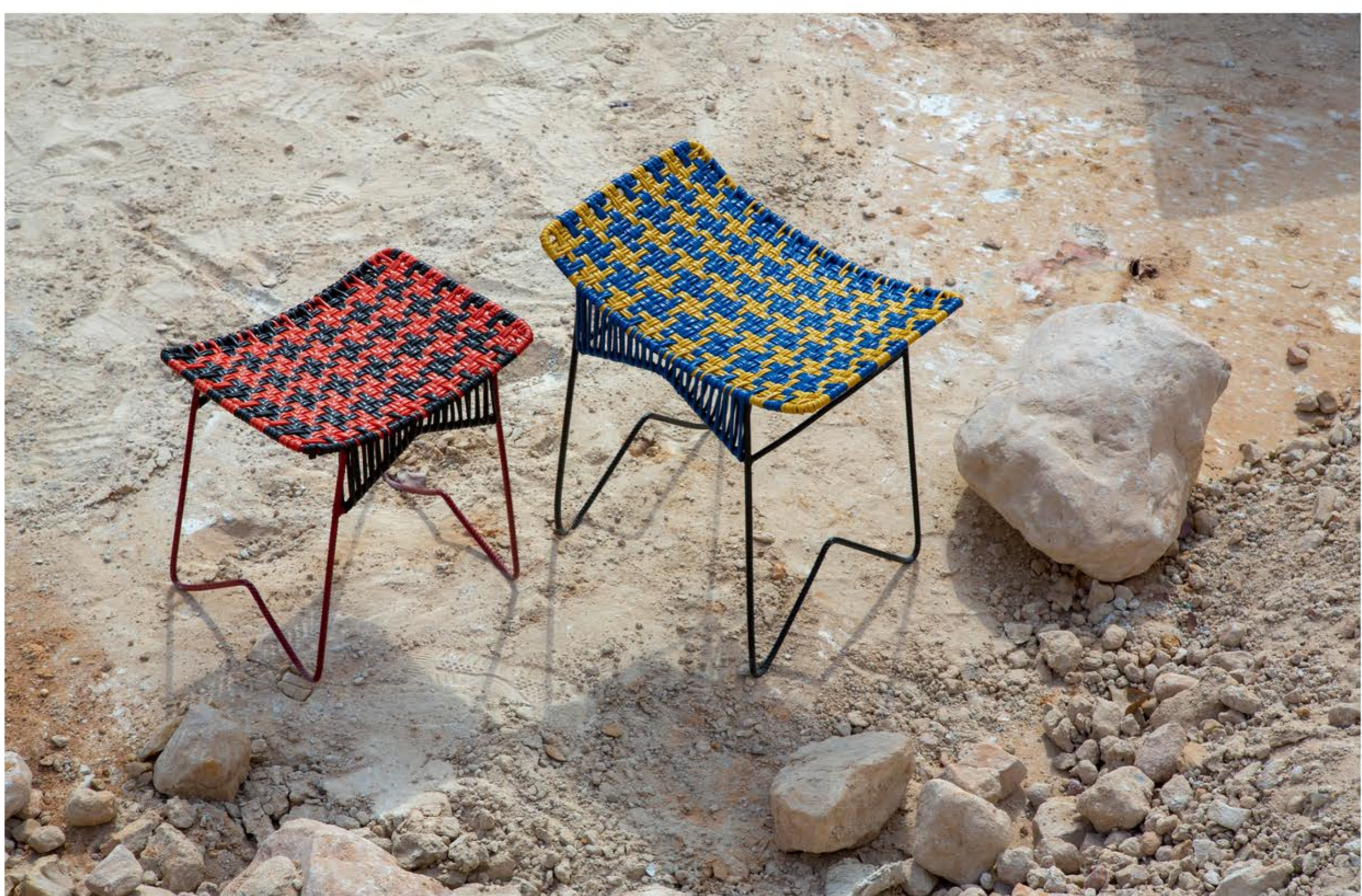
The collection is made up of 40 pieces, handcrafted by female artisans in Colombia.