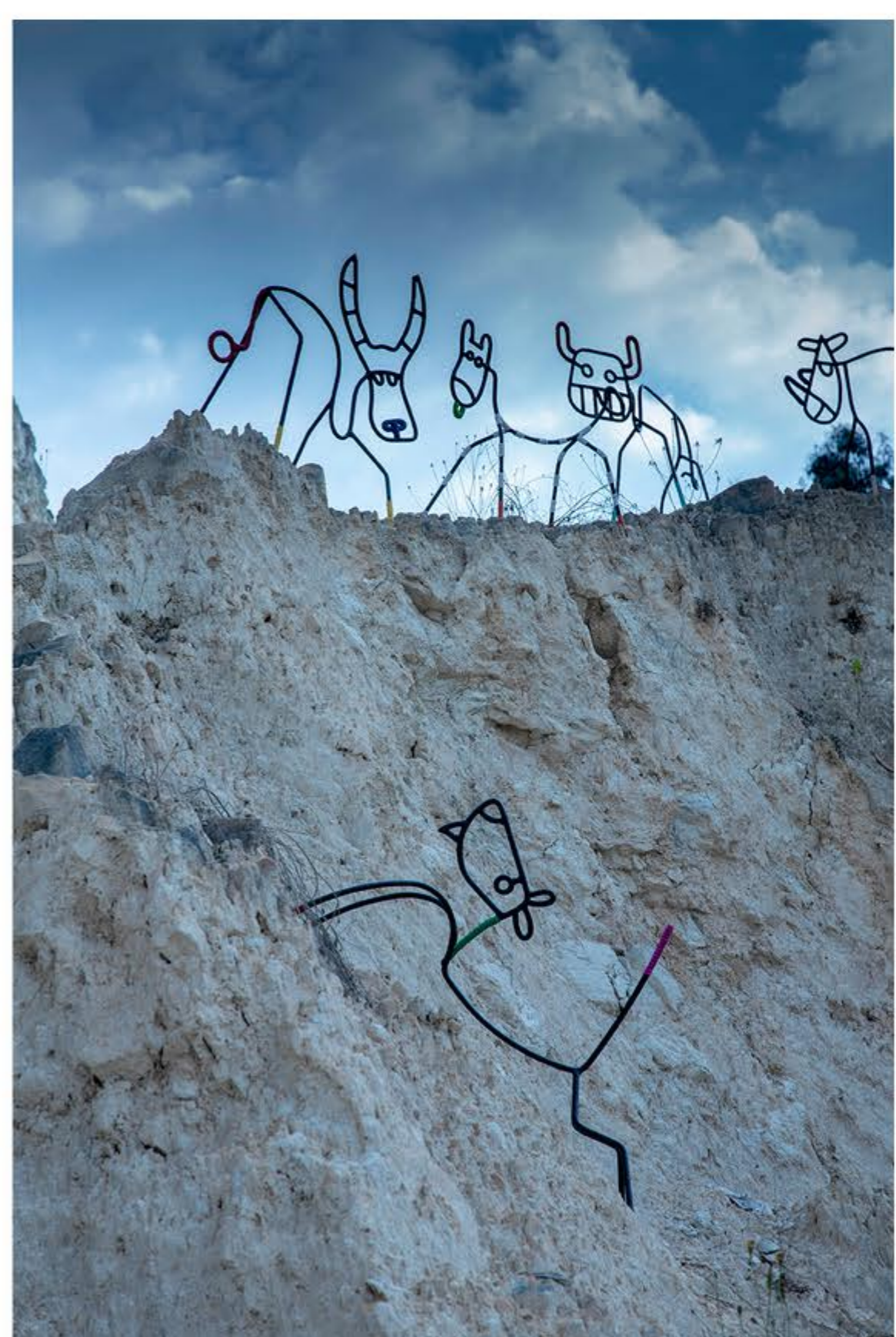
The other-worldly designs evoke tribal totems or aliens, synthesizing craftsmanship and innovative design.