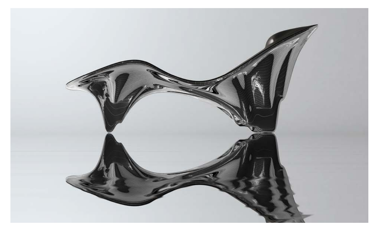
The collection's dining table (top) and chaise longue with upholstered leather (bottom) are made from CNC-ed aluminium and come in a variety of finishes